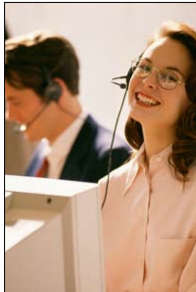
The Allocations Management module can help you automate your allocations so you spend more time raising funds and less time accounting for them.

When you do not know the specific allocation at the time of entry, you can use a holding or pooled segment code and allocate the pooled amounts when you know the correct allocation. A good example is utility costs; you may distribute electric and